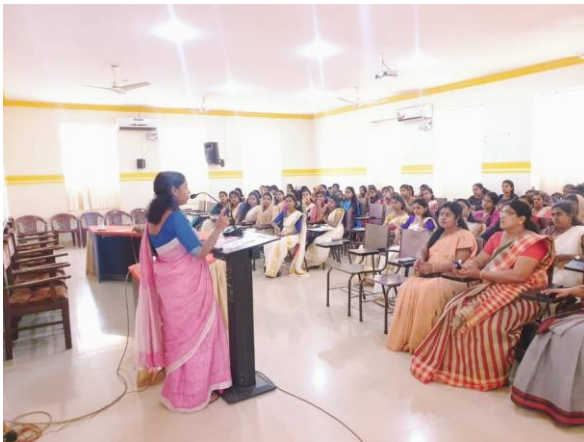
Atoken of appreciation to the organization