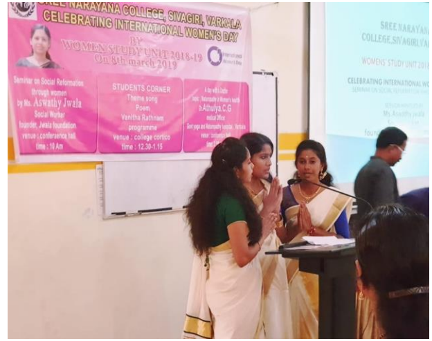
Prayer by college prayer team