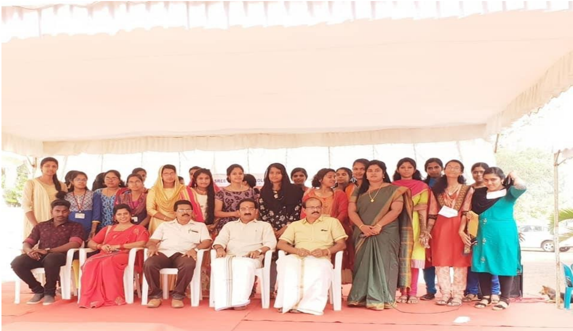
Participants with guests.....