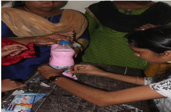
Lotion preparation by students.....