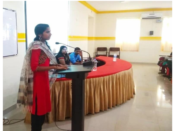
Felicitation by Vice Chairperson