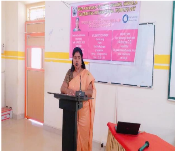
Coordinator introducing programme