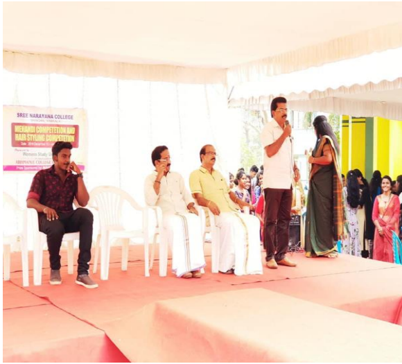
Principal addressing the gathering