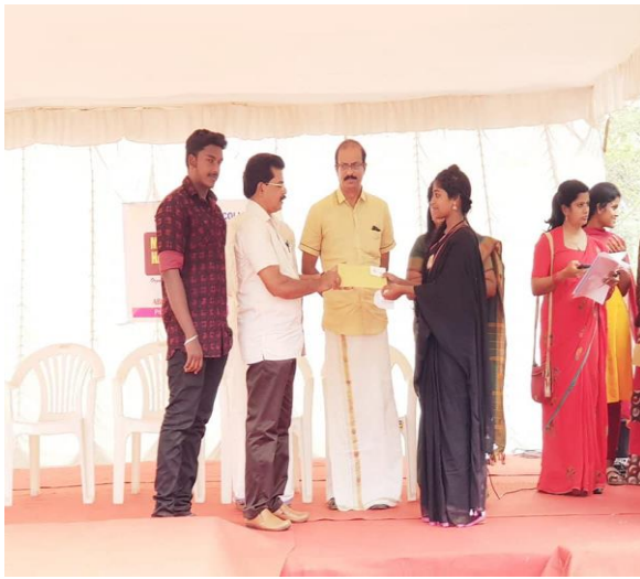
First prize- Hair Styling competition