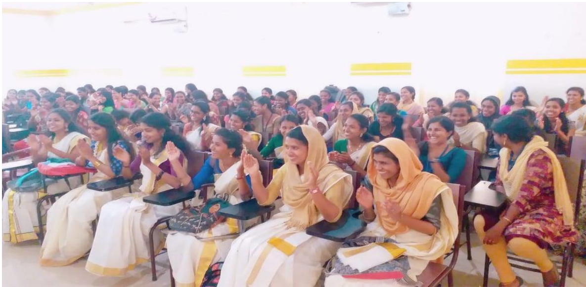
Audience of the programme .....