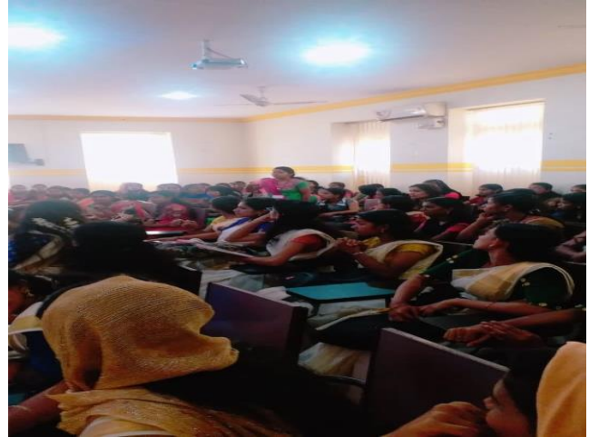
Audience clearing doubts....