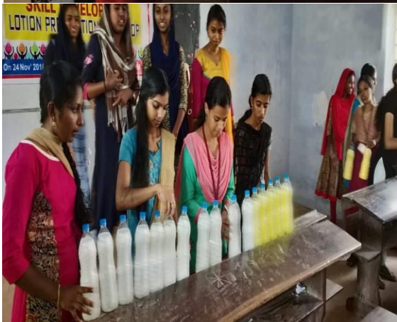
Lotion preparation by students.....