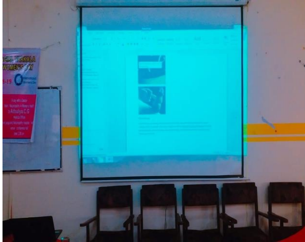
Powerpoint presentation during the session