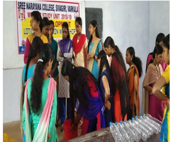
Lotion preparation by students.....