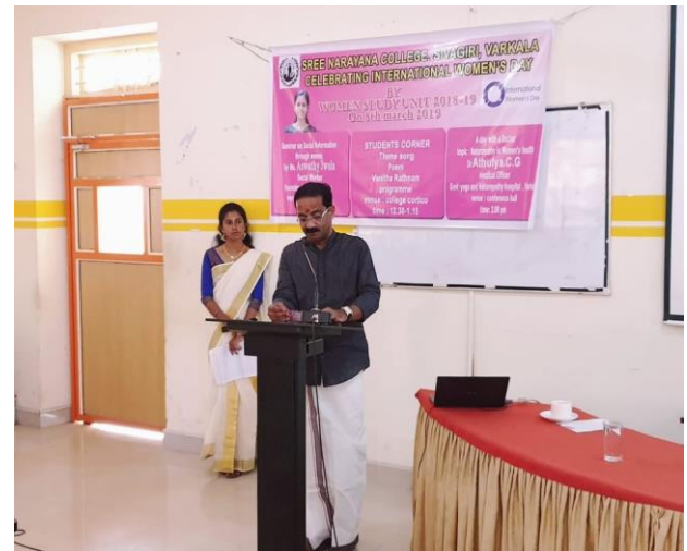
Presidential Address by Principal