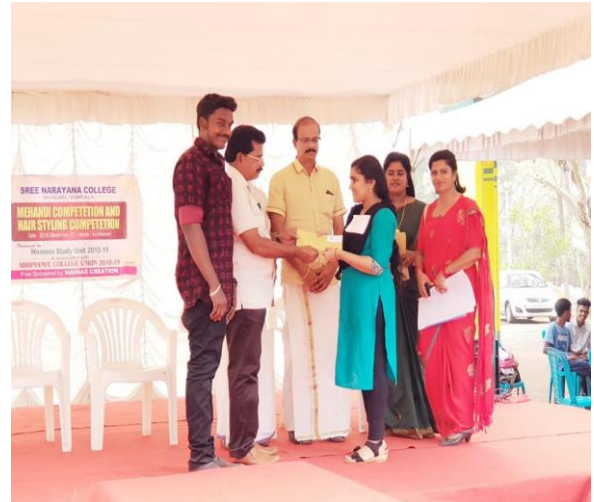
Second prize - Mehandi competition