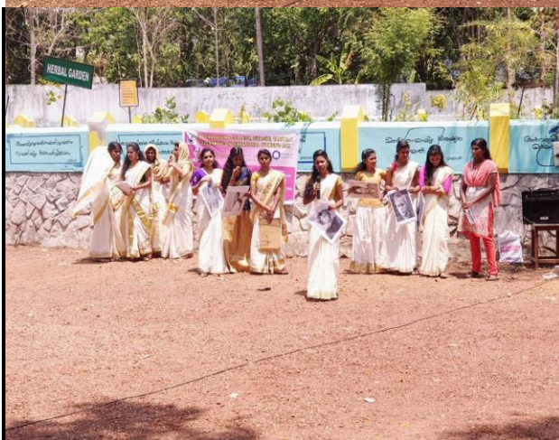
Vanitha rathnam Programme by members

SEMINAR ON NATUROPATHY IN WOMEN'S HEALTH