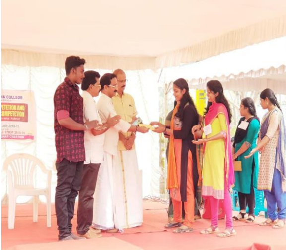
First prize – Mehandi competition