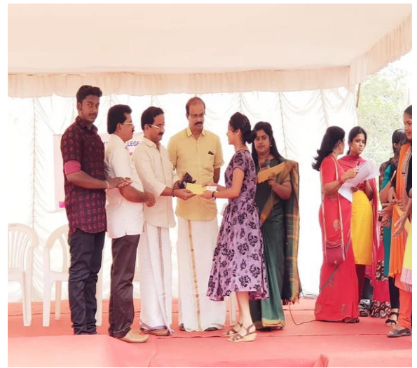
Second prize - Hair Styling competition