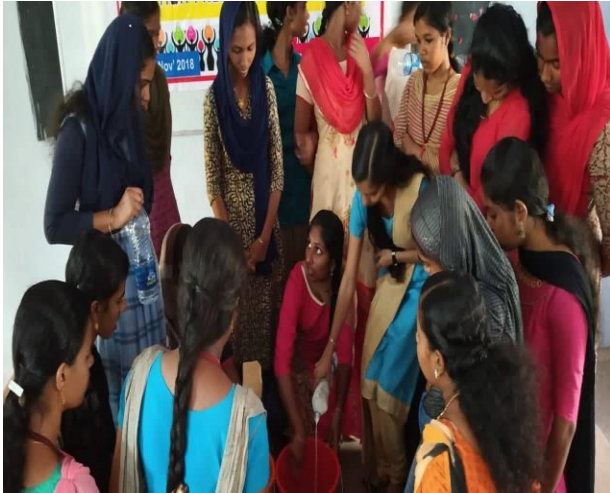
Lotion preparation by students.....

As part of the skill development initiative for the girl students, Women Study Unit organized a workshop on Lotion Preparation on 13/01/2019. All the process was done by the students from beginning to the end. Students produced 21 bottles of cleaning lotion and labeled it. Students took initiative to sell the product and decided to produce more products from its sales proceeds.