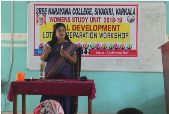
Ms. Jubilee S V handling the session

S V, lead the session. Students produced 21 bottles of cleaning lotion and labeled it. Students took initiative to sell the product and decided to produce more products from its sales proceeds.