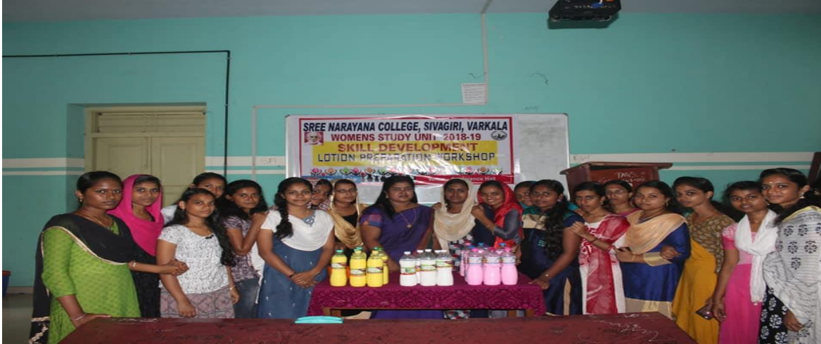
Women Study Unit team with the product