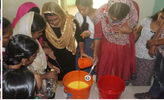
Lotion preparation by students.....