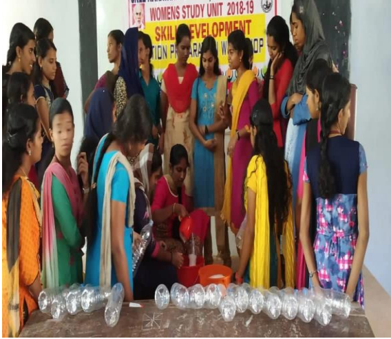
Lotion preparation by students.....