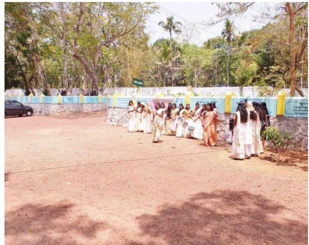
Theme song by WSU members